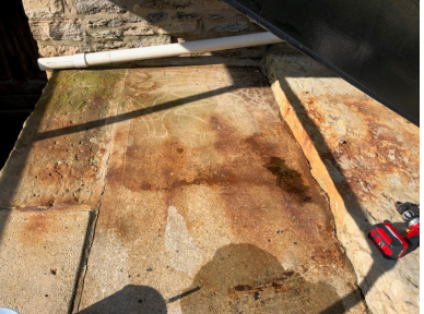
These before and after photos are of the concrete pad below and around the Holy Trinity sacristy stairs. No more rust or algae. Amazing!!